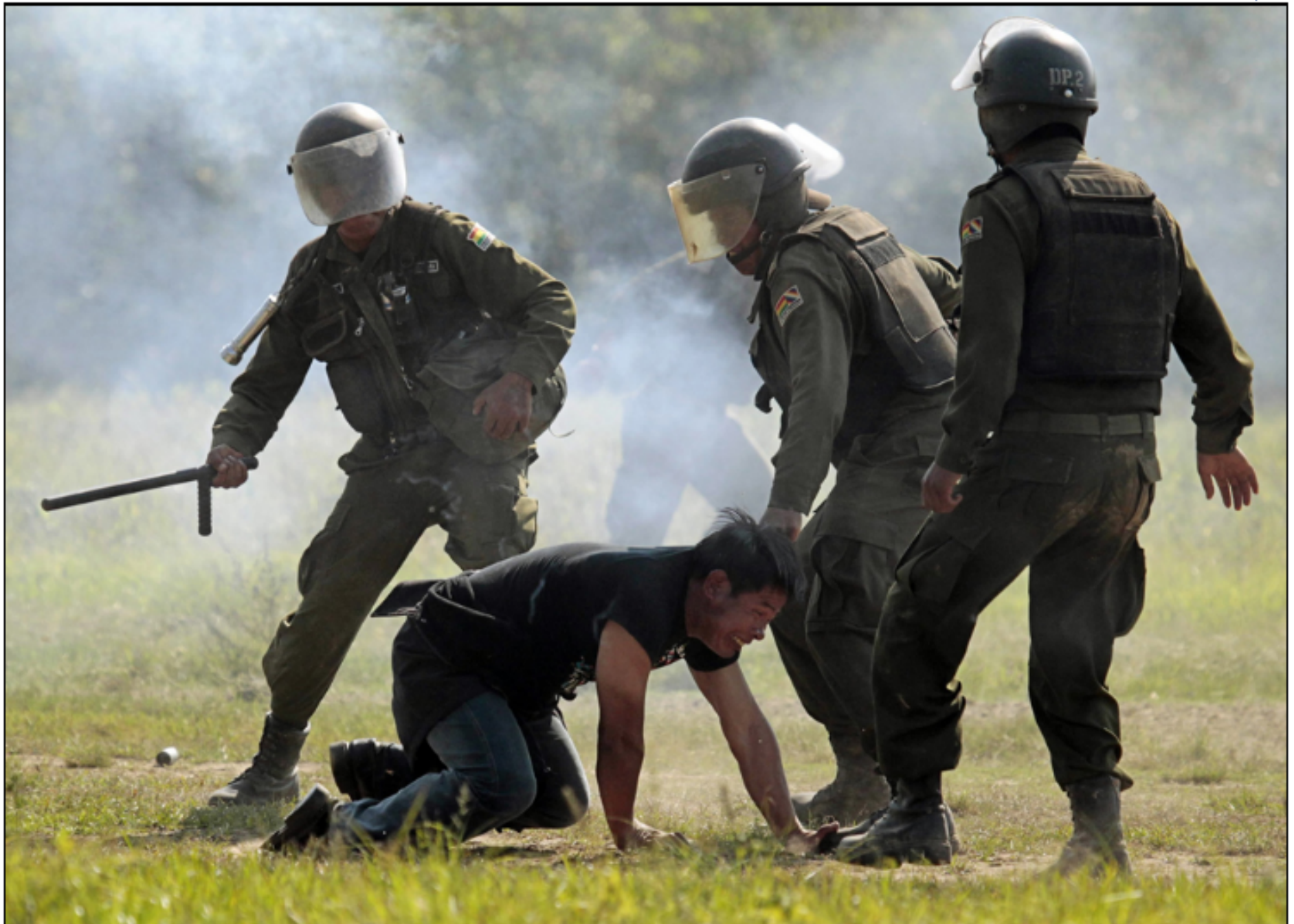
3 Police subdue a Bolivian from the Isiboro Secure indigenous territory after he and dozens of other protesters blocked an airport runway on Sept. 26. The demonstrators had been on a 370-mile protest march from Trinidad in the northern lowlands to the government seat in La Paz in an attempt to draw attention to the government's plan to build a highway through their territory. President Evo Morales ordered police to stop the march. As police were herding the protesters onto a plane at Rurrenbaque airport to return them home, a large group broke away and blocked the runway with burning wood and tires. #